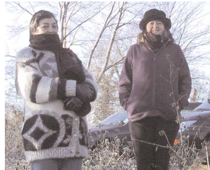
Above: The WOMEN wait for their men folk to return, like the loyal 'fluffy' things they are.

This year was a bit different as there was actually a purpose to it all. A dinghy owner from Littleton Sailing Club had lost some equipment overboard during December and we had been requested to find it. (Three of us spent an hour in the water on Christmas Eve, looking for – and recovering – a sail, but that's another story! Suffice it to say that the renowned brass hunter of the club is also lucky with sails.) This time we were looking for the rudder, but unfortunately we did not find it. Nothing to do with water temperature, disorganised searching techniques, or pub time approaching, of course. Although the viz was very good, the possible location of the rudder was not nearly so clear. Perhaps understandably, when a dinghy capsizes the crew have other things to think about rather than trying to take transits.